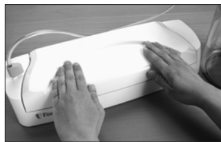
Press and Release Lid